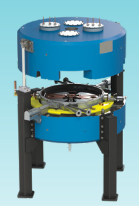
Best Model 6-15 MeV Compact High Current/Variable Energy Proton Cyclotron