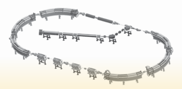
Best Particle Therapy 400 MeV ion Rapid Cycling Medical Synchrotron (iRCMS)