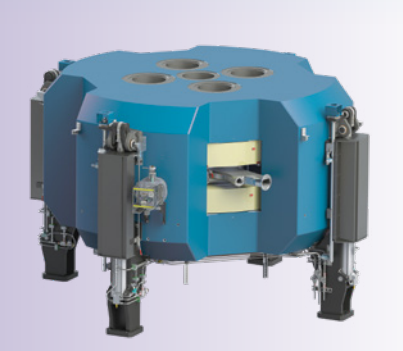
Best Model B35ADP Alpha/Deuteron/Proton Cyclotron