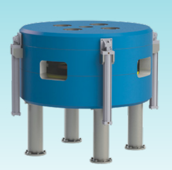
Best Model B25p Cyclotron