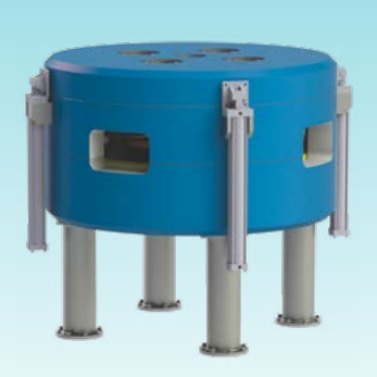
Best Model B25p Cyclotron