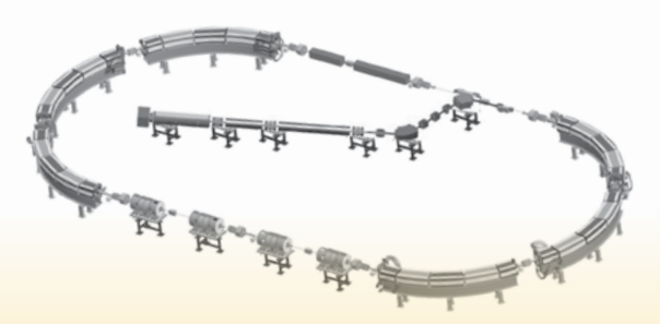
Best Particle Therapy 400 MeV ion Rapid Cycling Medical Synchrotron (iRCMS)