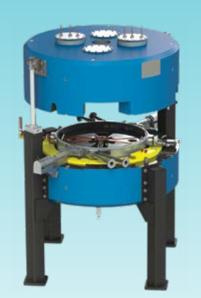
Best Model 6-15 MeV Compact High Current/ Variable Energy Proton Cyclotron