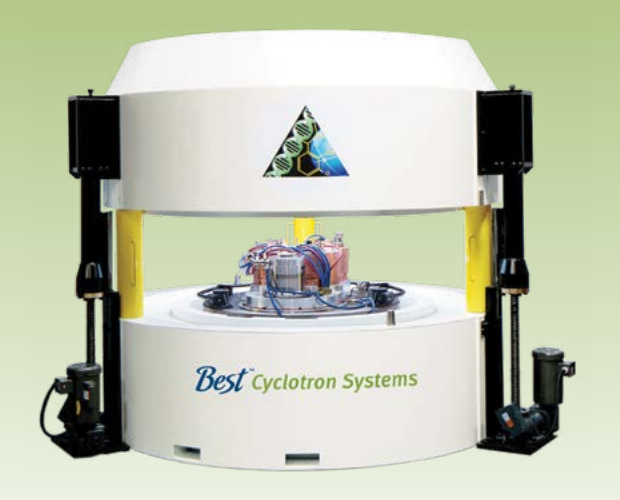
Best B 100p, BG 95p and B 11p Sub-Compact Self-Shielded Cyclotron w/Optional Second Chemistry Module