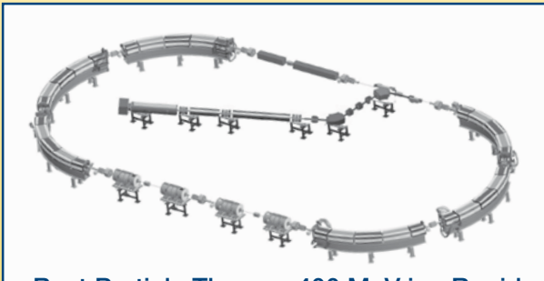
Best Particle Therapy 400 MeV ion Rapid Cycling Medical Synchrotron (iRCMS)