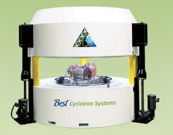
Best B 100, BG 95 and B 11 Sub-Compact Self-Shielded Cyclotron w/Optional Second Chemistry Module