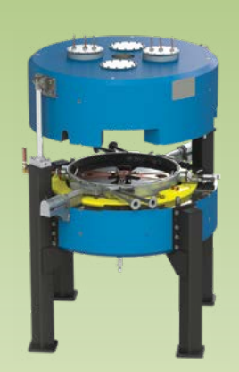
Best Model 6-15 MeV Compact High Current/ Variable Energy Proton Cyclotron