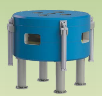
Best Model B25p Cyclotron