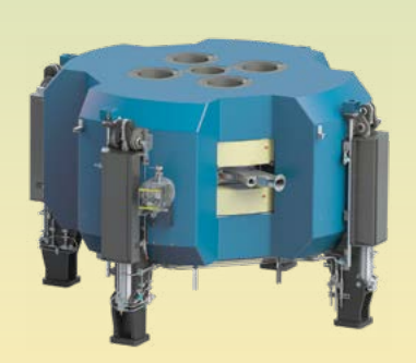
Best Model B35ADP Alpha/Deuteron/Proton Cyclotron