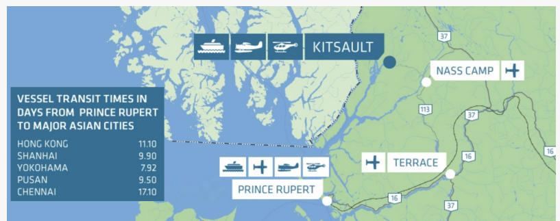
Vessel Transit Times